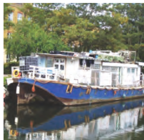
SHOULD FIND PROPER MOORING

The Elmbridge Residents Group, of which our MRA councillors are influential members, covers the areas of Esher, Hersham, Hinchley Wood, Molesey, Thames Ditton, Walton, Weston Green & Weybridge. This Group have had intermittent control or led Elmbridge council in 17 years over the last 28 years period.