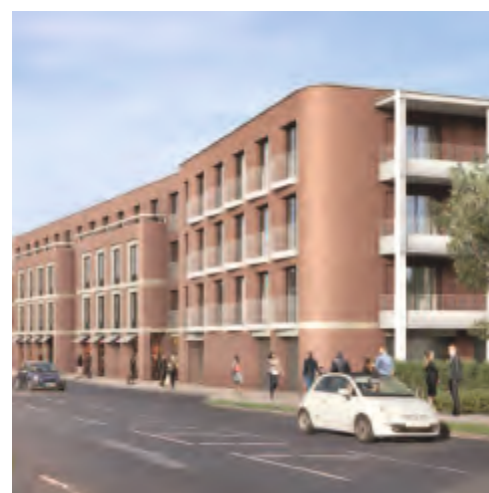
JOLLY BOATMAN/STATION PROPOSAL