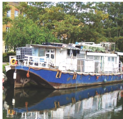
SHOULD FIND PROPER MOORING

The Molesey Residents Association is a member of The Elmbridge Residents' Group. This consists of the Residents Associations of the following areas: