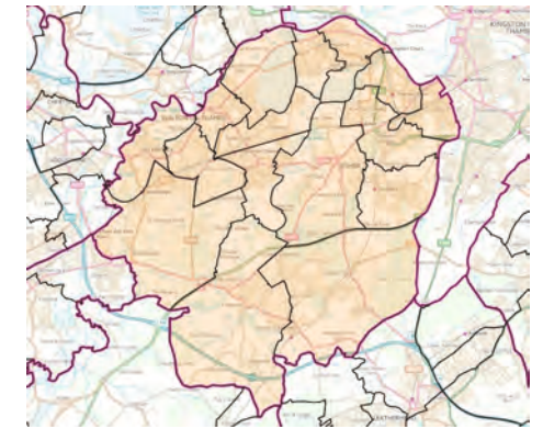
Elmbridge Residents' Group Councillors serve across the Borough

Esher, Hersham Village, Hinchley Wood, Walton, Molesey, Thames Ditton & Weston Green and Weybridge & St George's. As a group, the councillors representing these associations have controlled or led control of Elmbridge Borough Council for 19 of the last 30 years. The following are the core policies we have all agreed on.